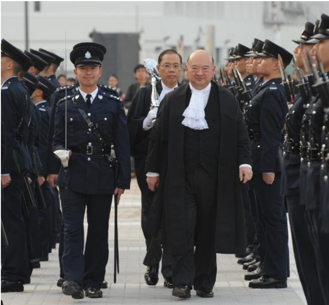
The Chief Justice of the Court of Final Appeal, Mr Geoffrey Ma Tao-li, inspects the guard of honour mounted by the Hong Kong Police Force at Edinburgh Place, during the Ceremonial Opening of the Legal Year 2012, today (January 9).